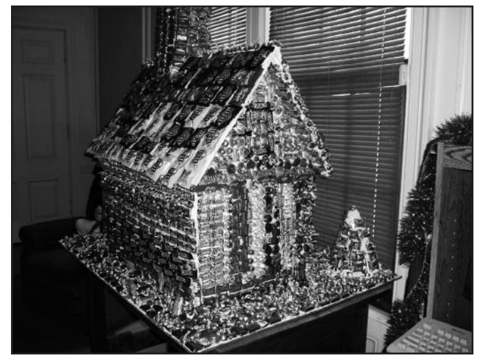
This holiday donation of a candy house from Aspirus Keweenaw Fitness Center made kids of all ages happy.